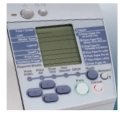
Use the control panel to select paper type, layout and image size.